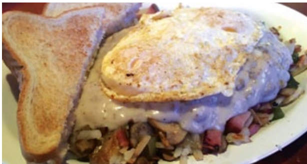
↑ Ultra Classic Breakfast