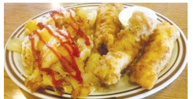
↑ Fried Cod Fish Special