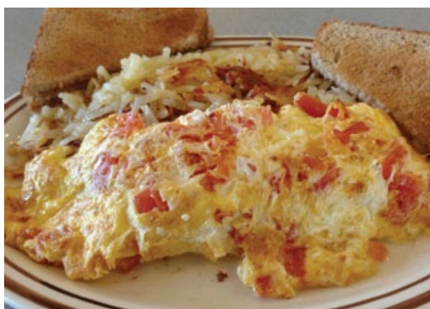
↑ Greek Omelet

There are 12 excellent omelets so it is hard to pick just one. The Greek Omelet has a nice flavor with onions, tomatoes and feta cheese. And if you are in the mood for a Southwestern taste the Mexican Omelet is good with ground beef, green peppers, onions, tomatoes and cheddar cheese. You can make this a little spicier by requesting hot sauce and jalapeños.