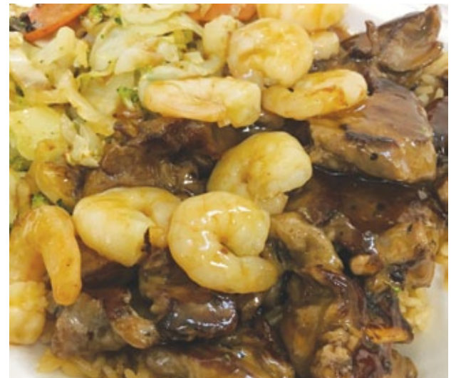
BEEF AND SHRIMP TERIYAKI WITH FRIED RICE

There are surprisingly tasty Hamburgers, Hot Dogs and even Gyros sliced from a vertical rotisserie. I also recommend the Chicken Strips and Chicken Wings served with your choice of BBQ, ranch or Hot Sauce for dipping.