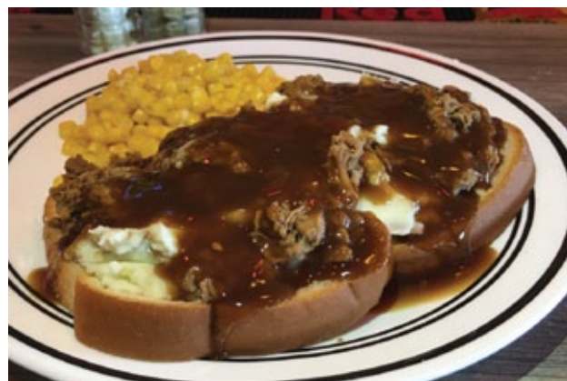
OPEN FACE ROAST BEEF WITH MASHED POTATOES AND CORN